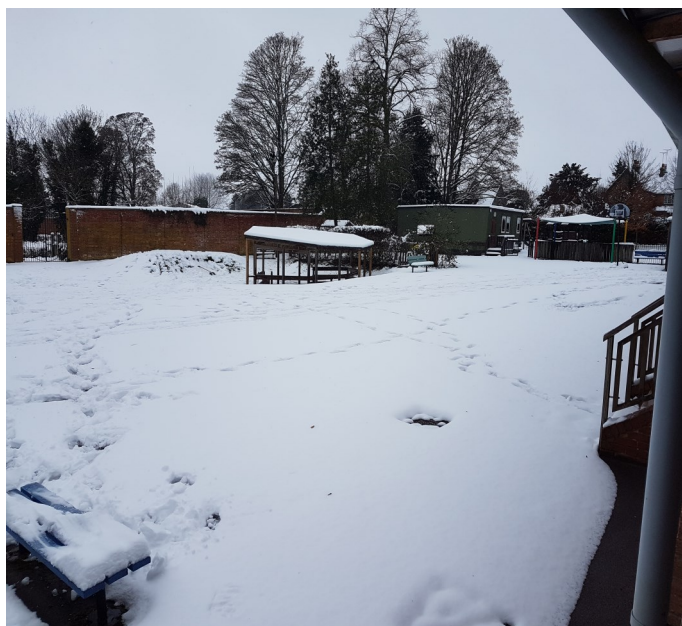
A winter scene in our school