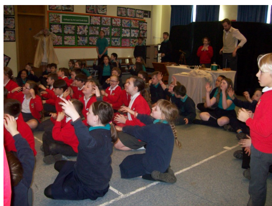
Henley Youth Festival

The Tempest work- shop with Peppard primary